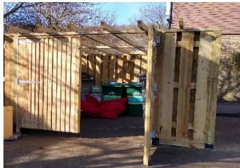
Pathway widened to improve access on link pathway to bus stop ( Downland Court )